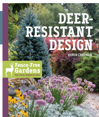
LATEST RELEASE (Timber Press, 2019)

Articles and designs featured in major publications including BETTER HOMES & GARDEN, GARDEN DESIGN, SUNSET, and FINE GARDENING