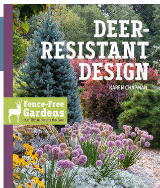
LATEST RELEASE (Timber Press, 2019)

Articles and designs featured in major publications including BETTER HOMES & GARDEN , GARDEN DESIGN , SUNSET , and FINE GARDENING