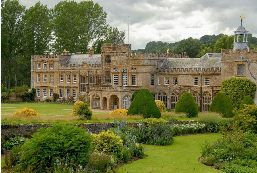
Forde Abbey.

THIS TOUR IS NOW FULL – BUT YOU MAY JOIN OUR WAITING LIST